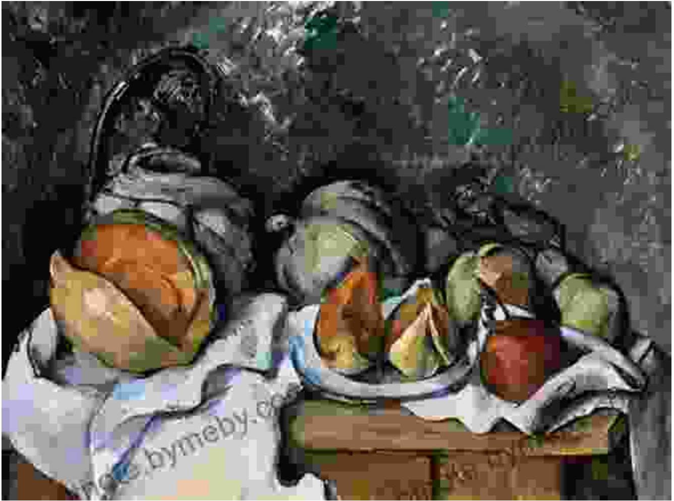
Cezanne's "Still Life with Fruit and a Pot of Ginger" (c. 1877-1878)

Cezanne's still lifes are equally captivating. "Still Life with Fruit and a Pot of Ginger" is a stunning example of his ability to transform everyday objects into works of art. The arrangement of fruit, pottery, and fabric exudes a sense of abundance and warmth, inviting the viewer to savor the stillness of the moment.