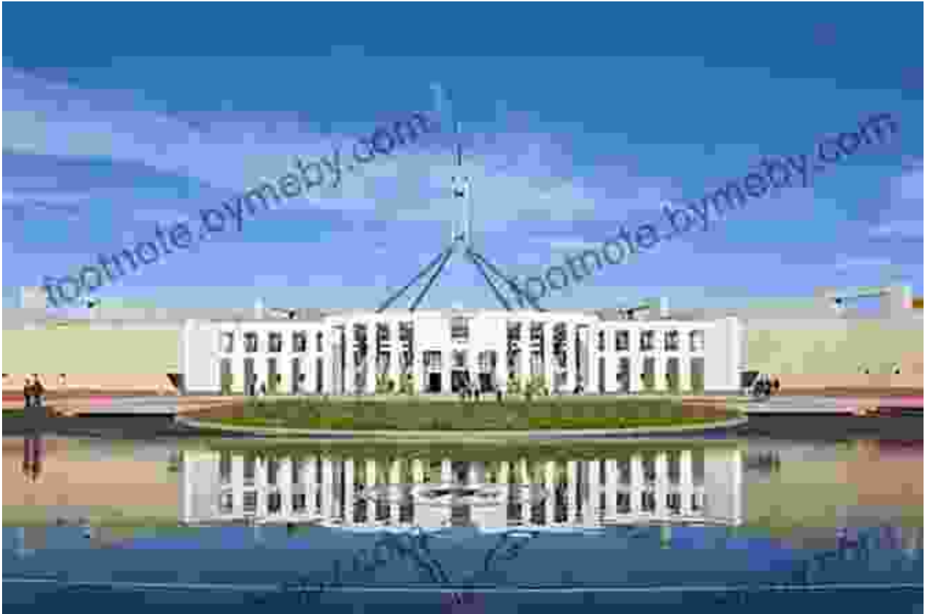
Canberra parliament house