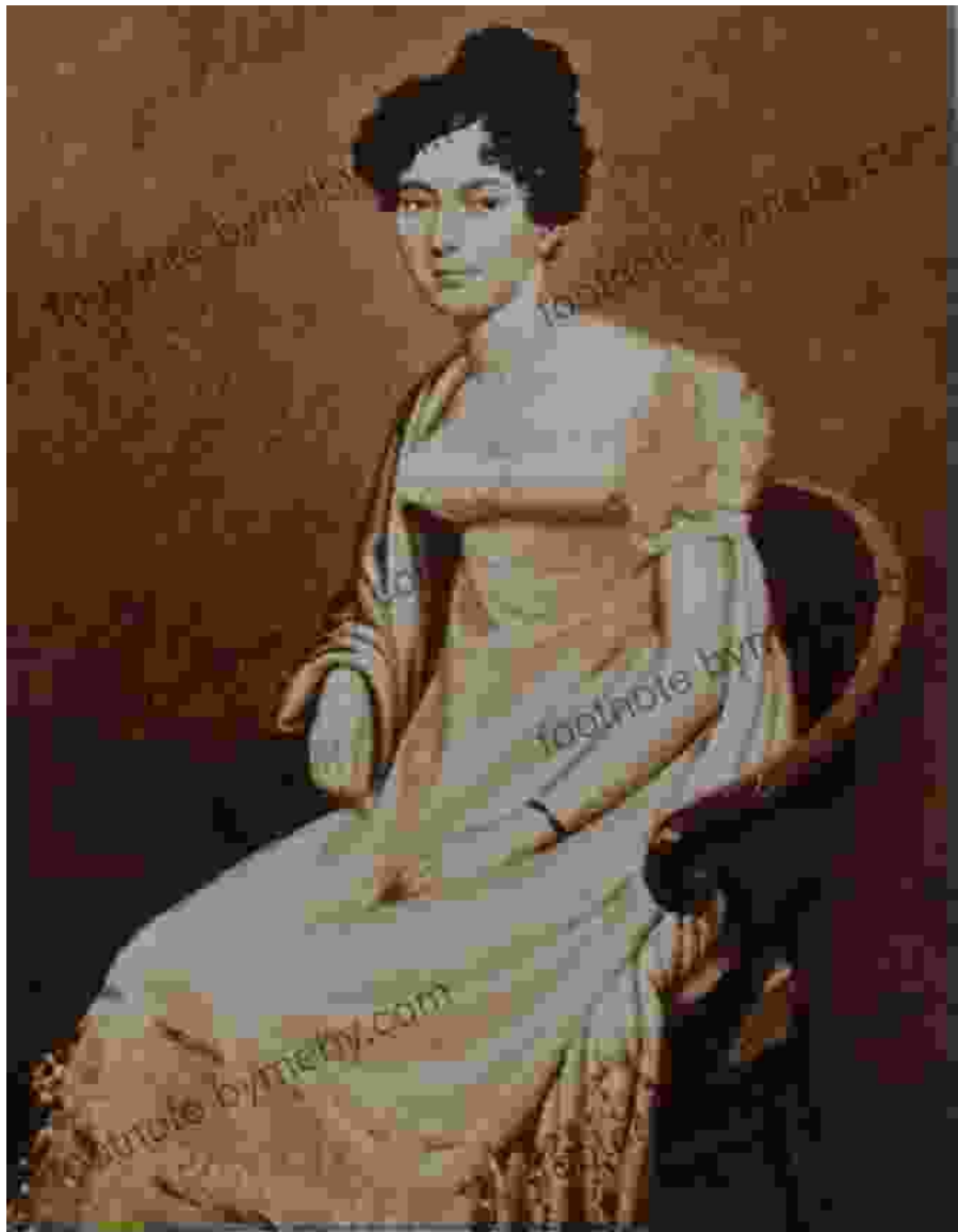
Lady Juana Maria Smith

Together, Harry and Juana navigated the challenges of military life with unwavering support for each other. Juana accompanied her husband on campaigns, providing solace and encouragement amidst the chaos of war. Her courage and resilience inspired the admiration of all who knew her.